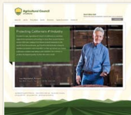
Ag Council Website