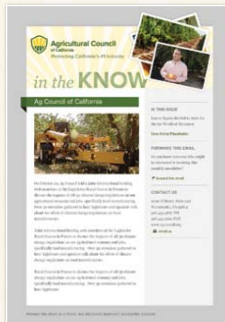
Ag Council In the Know eNewsletter